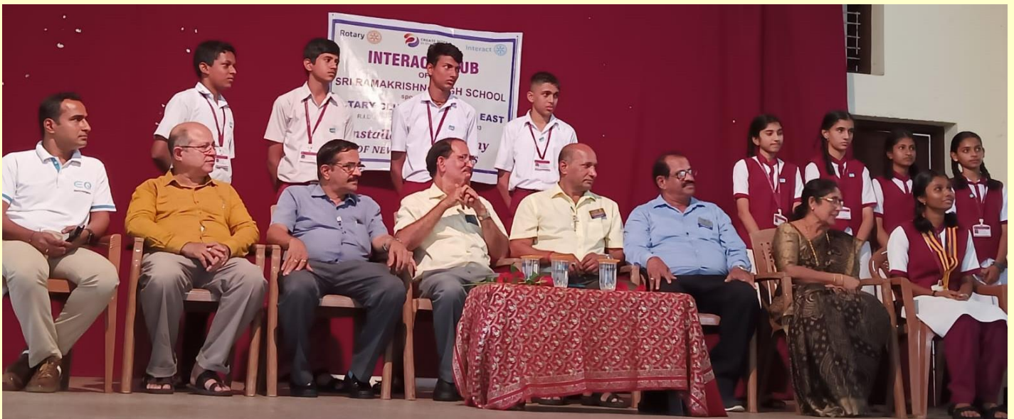
Interact Club Ramakrishna High School