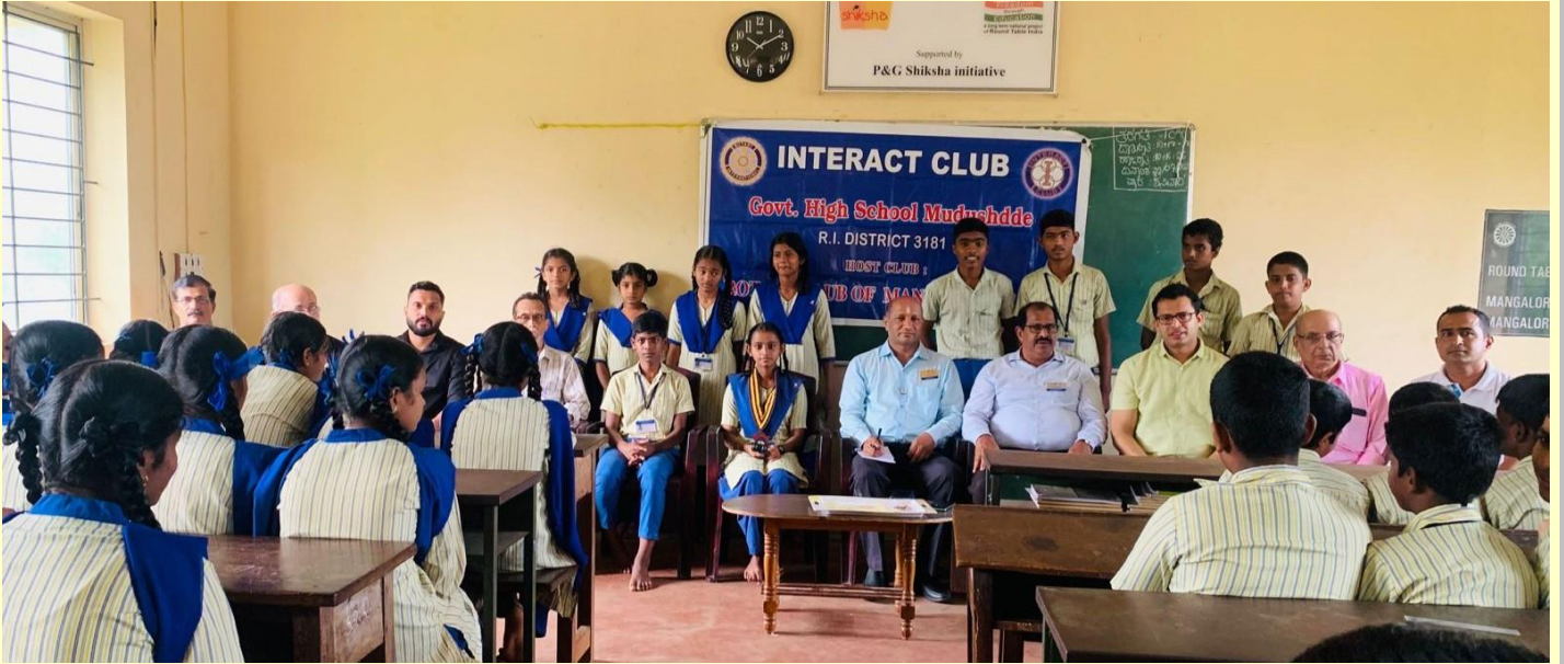
Interact Club Govt High School Mudushedde.