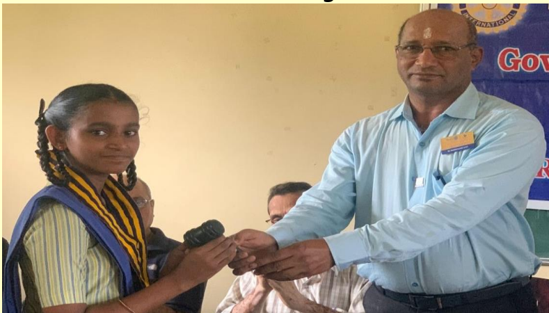
President Interact club GHS Mudushedde