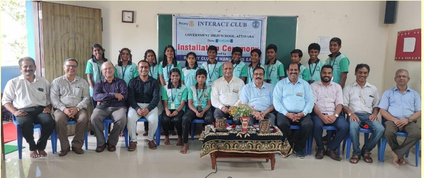
Interact Club Govt High School Attavara