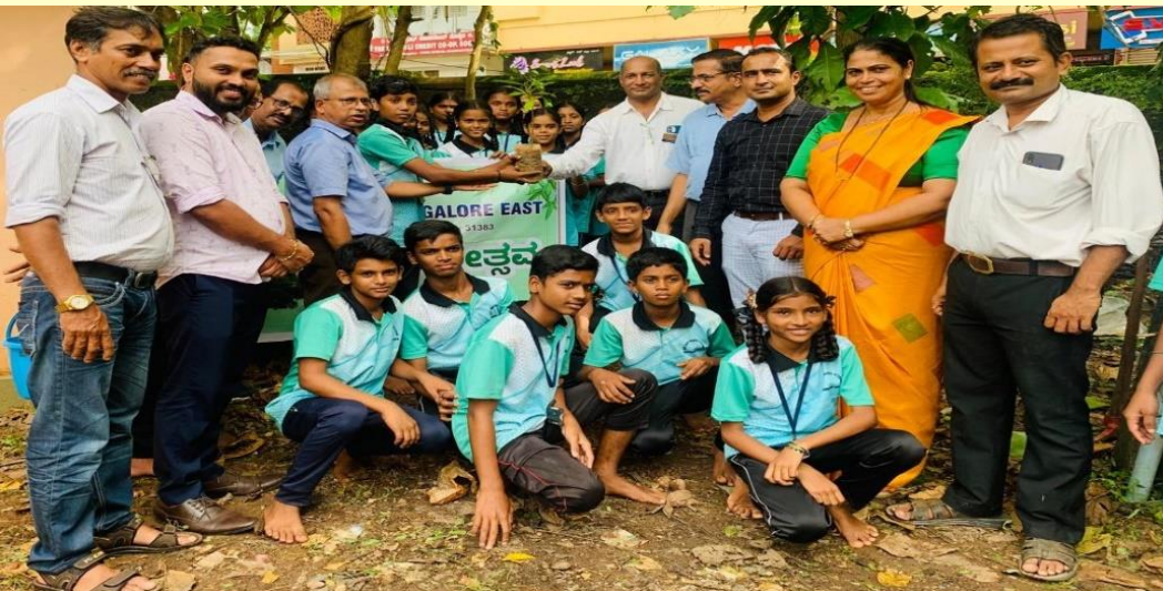
At Govt High School Attavara.....